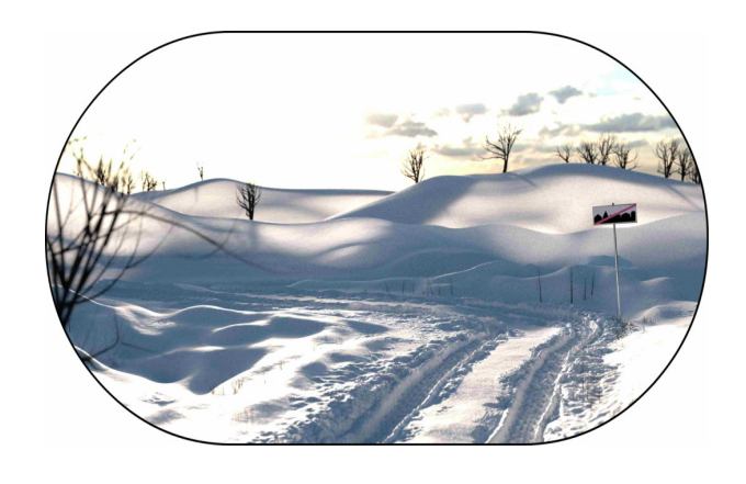
Blender artwork by Szymon Igras