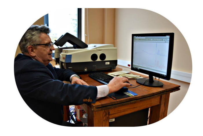
Atomic force Microscopy (AFM) - vision of the sur- Spectrometer FTIR (Fourier Transform Infra-Red) face in the nano scale