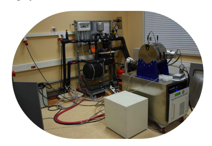
Spectrometer NMR with electromagnes 3 T (Tesle)